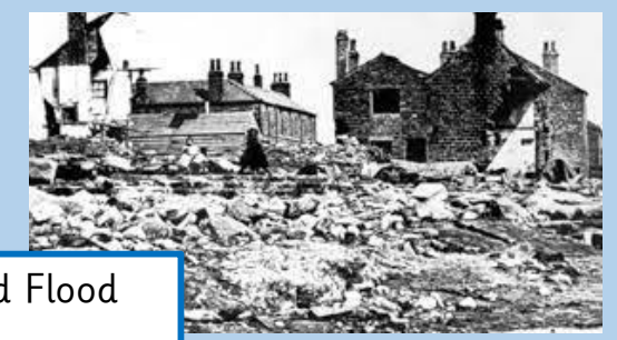
The Great Sheffield Flood 1864